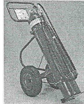
□ 3600 SERIES