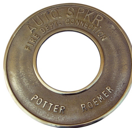
MODEL 5962 (Shown)

Brass flanged sillcock with 3/4" female N.P.T. inlet x male G.H.T.; stem shield and removable tee handle key.