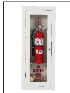
MODEL FRC1870-A (Shown)