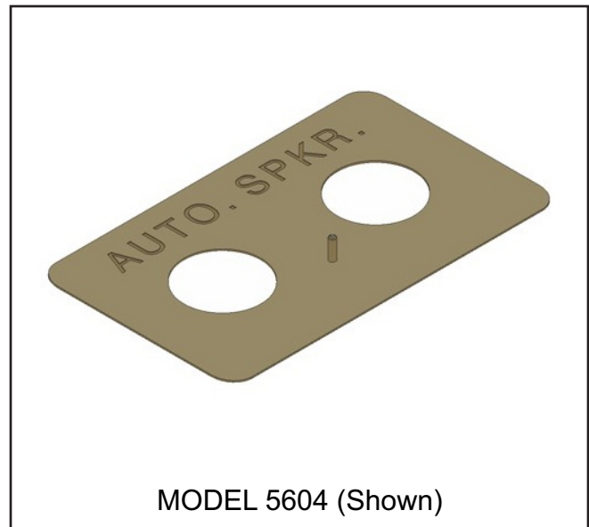
MODEL 5604 (Shown)