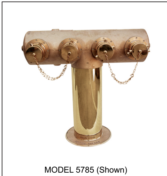
MODEL 5785 (Shown)

NOTE: Model 5761SC furnished with model 5715 single clapper body