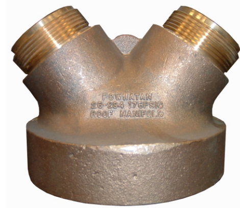
MODEL 5872 (Shown)