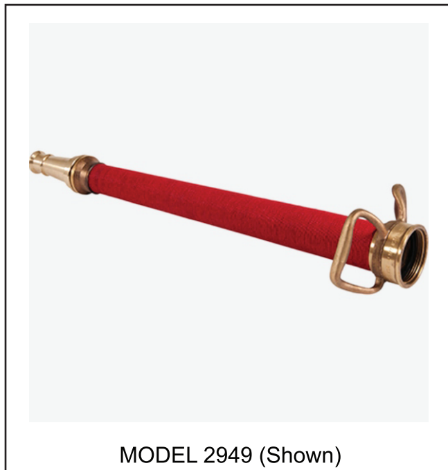
MODEL 2949 (Shown)