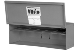
SPARE HEAD BOX MODEL 6162