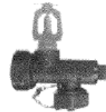
LINE TESTER MODEL 6175