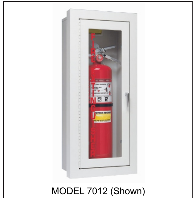
MODEL 7012 (Shown)

Model 7070-7089: Brass - Polished finish, clear polyester coated