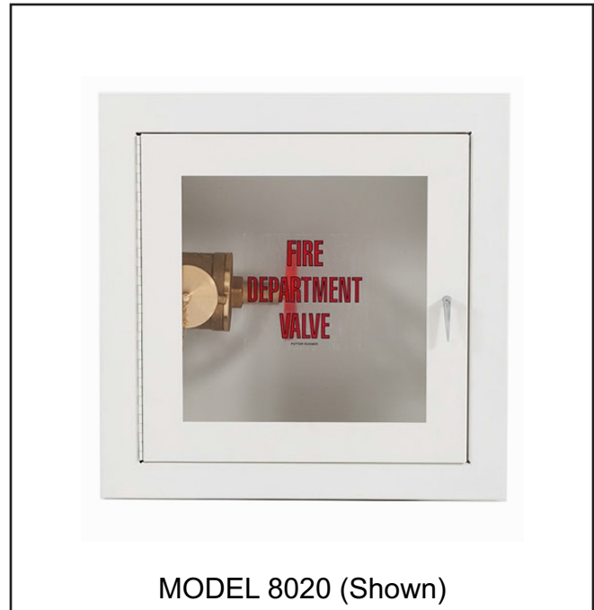
MODEL 8020 (Shown)

Model 8060-8089: Brass - Polished finish, clear