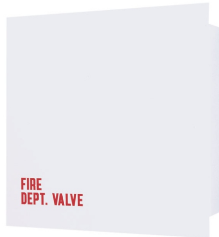
MODEL FRC8220 (Shown)