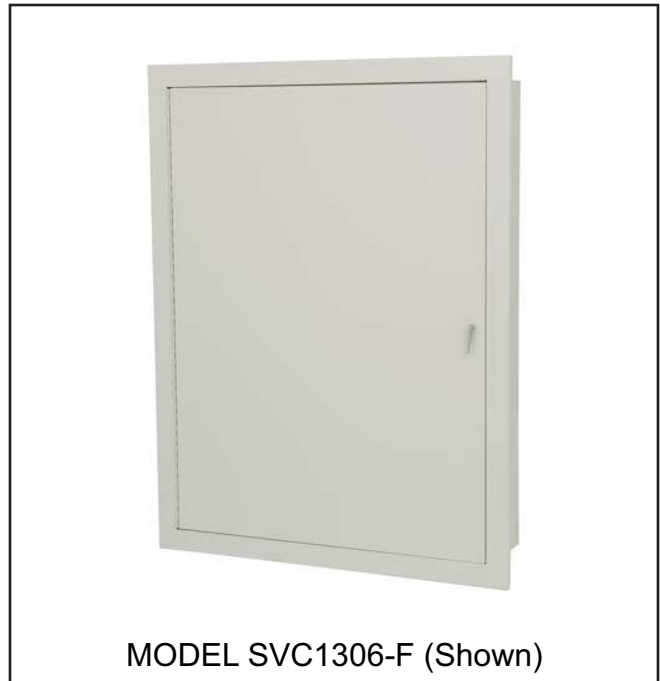
MODEL SVC1306-F (Shown)

SPRINKLER CONTROL VALVE CABINET , fabricated of Galvannealed Steel, 20 ga. box (18ga. surface mounted box), 20 ga. tubular door with 18 ga. frame and a continuous steel hinge. Left hand hinge standard. All components are powder-coated with an electrostatically-applied, thermally-fused, recoatable white polyester finish. Wall mounting and size of cabinet as selected by model number.